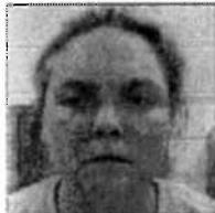
Etowah County woman accused of running girl to death revisits crime scene 04/13/2012