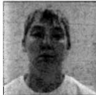
Gadsden woman charged with sodomizing 14-year-old girl 04/5/2012