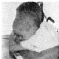
Henrico daycare under fire for child abuse 04/18/2012